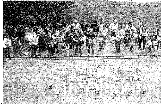
Mobilizzazione Centinaia di lavoratori della Battistero, giovedì, hanno presidiato il palazzo della Provincia in attesa di avere notizie sul futuro dell'azienda

Nel corso dell'assemblea sindacale dei lavoratori, ieri, «sono stati riassunti tutti i passaggi della delicatissima vertenza» che giovedì ha avuto un'improvvisa accelerazione. Dalla conferenza stampa di sabato scorso infatti è partita «una mobilitazione straordinaria, come non se ne vedeva da tempo. Tre presidi in due